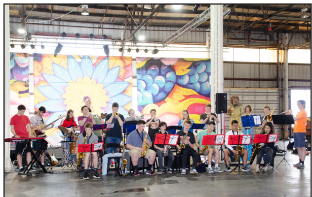
Newton jazz students performing in NOLA, April 2019

Your participation is greatly appreciated! Thank you for providing the gift of music education.